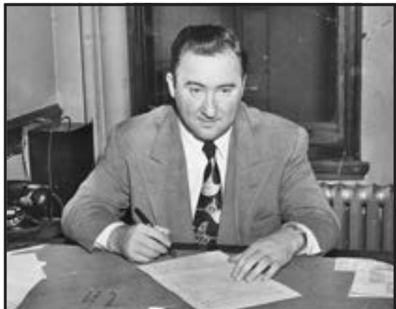
In the office