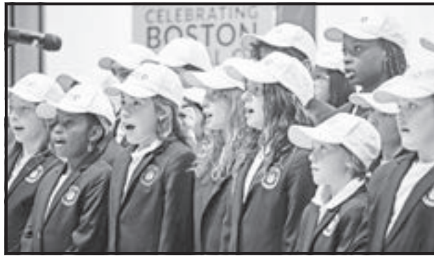
Students of K-12 Eliot Innovation School performing the Italian National Anthem at the opening of the FIC event