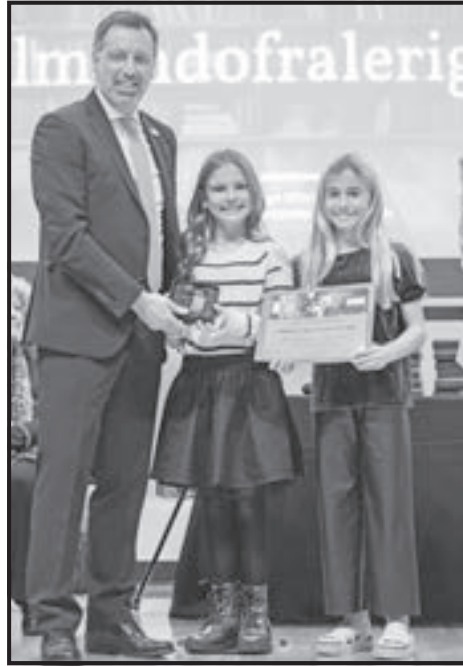
Consul General Arnaldo Minuti during the FIC Award ceremony of talented students in Italian language