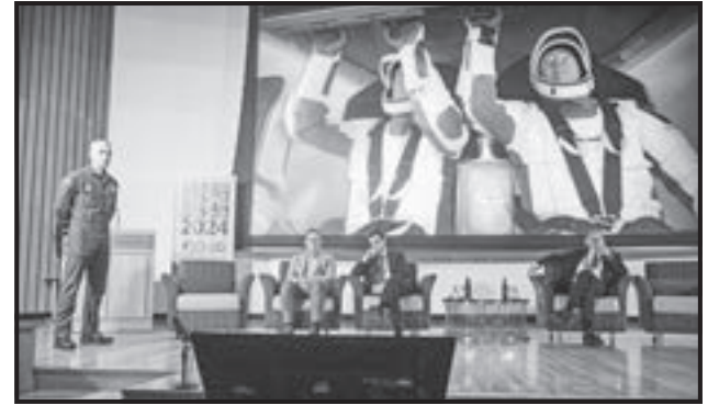
Celebrating the Italian National Day of Space at the FIC with Italian Astronaut Colonel Walter Villadei