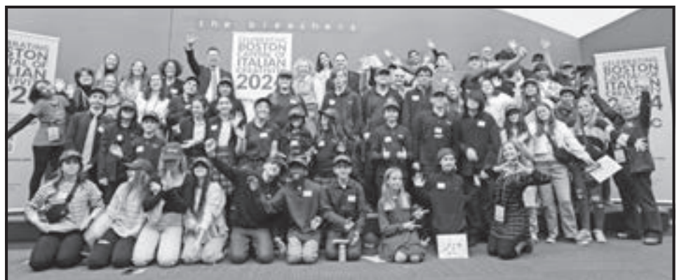
Students at the FIC attending one of the Lab days classes