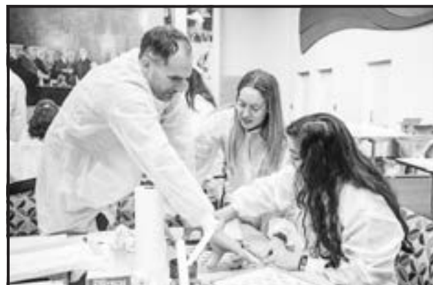
Italian students at the Silk Lab discovering innovative ways to use silk and learning Italian, thanks to Tufts University