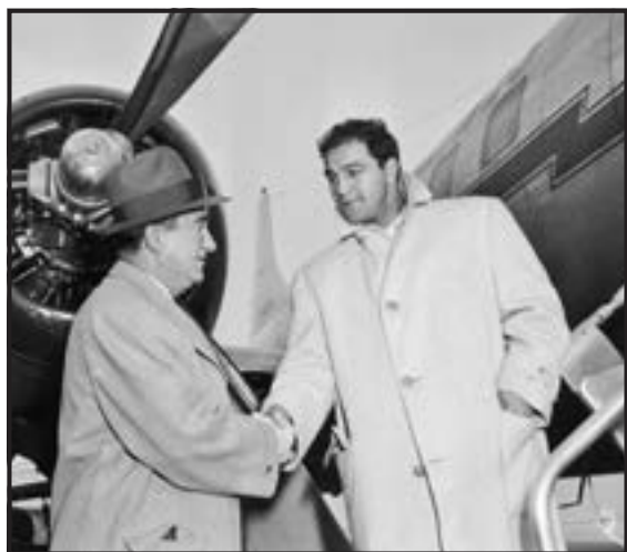
Greeting Rocky Marciano