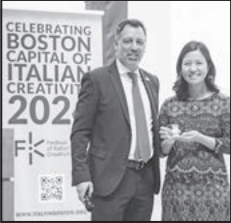
Consul General Arnaldo Minuti and City of Boston Mayor Michelle Wu at the opening ceremony of the FIC