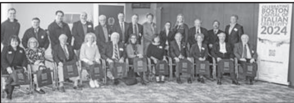
Italian American Association Presidents during the meeting at the FIC