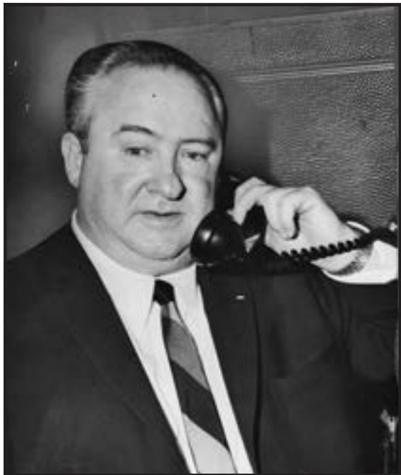
Always with the phone