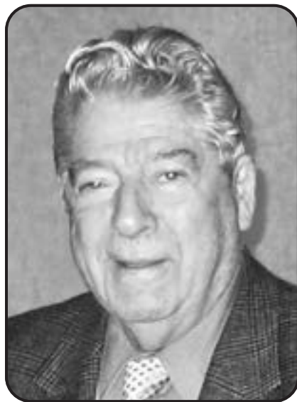
Judge Joseph V. Ferrino November 22, 2020