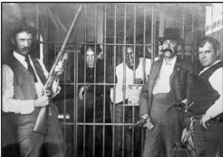
Choynski and Johnson Sharing in a cell in Galveston