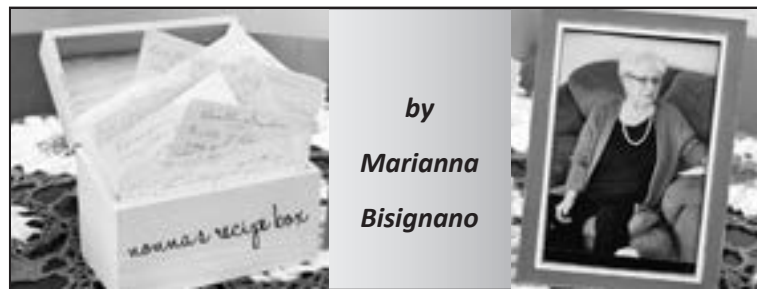
by Marianna Bisignano

Almost all Italian families have their own special recipe for Torta di Mele (Apple Cake). Unlike American apple cakes that are mainly batter and spices, Italian apple cakes are all about the apples and contain very little batter. The essential ingredients are simple and familiar — apples, flour, sugar, eggs, a touch of oil or butter, milk, leavening, and, depending on its origin, a unique hint of regional flavor.