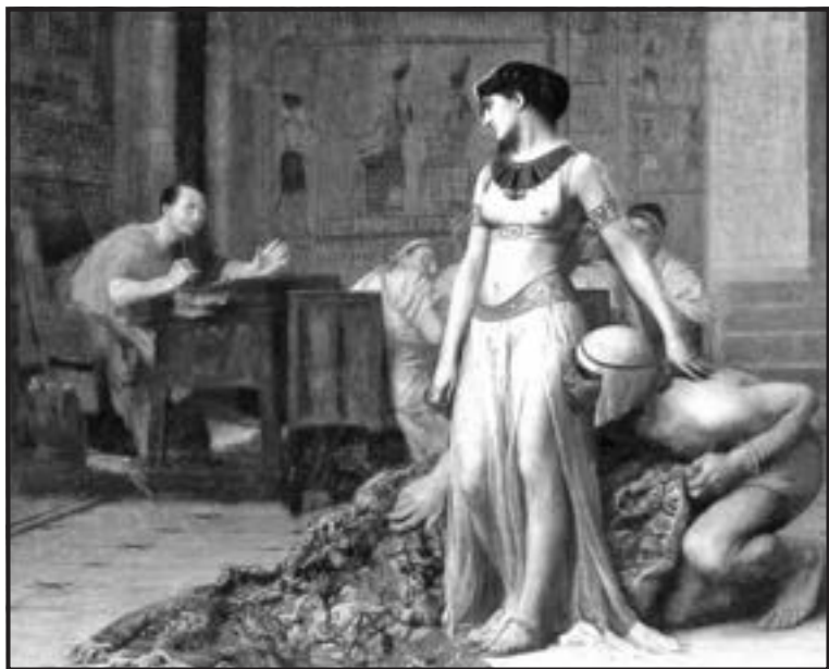
Cleopatra and Caesar by Jean-Léon Gérôme, 1866

The Roman calendar became quite hopelessly confused after much tampering by officials for various reasons, such as prolonging their terms in office, also, to hasten or delay elections. Caesar consulted with the Egyptian astronomer Sosigenes to fix the normal year at 365 days plus leap year. This we call the Julian calendar and it was in use until 158 when the Gregorian calendar corrected the error of eleven minutes and fourteen seconds per year.