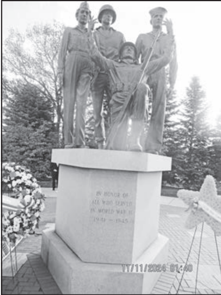
Quincy's Soldiers Monument Park dedicated to all those who served their country