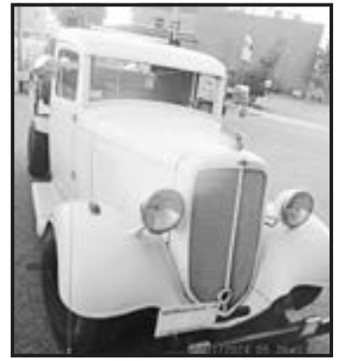
A 1933 Chevrolet work truck great for hauling home groceries

I was in the Marshfield area last week and found myself smiling while filling up my gas tank at $2.69 per gallon at the Nouria gas station at the Marshfield-Pembroke border on 139.