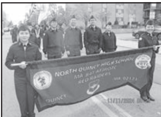
North Quincy High School AFJROTC

This year's Veterans Day parade was held on a great day, the winds I felt in Boston two days prior had quieted down, the sun was shining and the temperature was really mild. Crowds cheered everyone on and the ceremony at the Soldiers Monument Park across from the Korean War Memorial reminded all why we must always remember how special this day is. Let every day be Veterans Day!