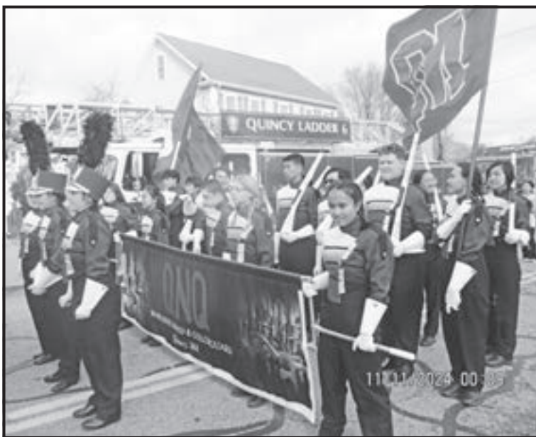
Quincy North Quincy Marching Band & Color Guard

On Veterans Day, Monday, November 11th, I marched in my second Veterans Day parade because I always remember the sacrifices made by those who served and defended this nation since its birth in times of war and in peacetime.