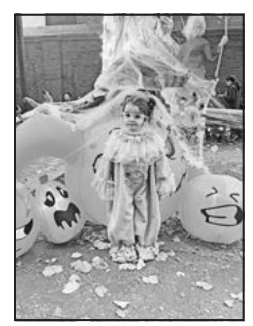
Halloween at the Prado, North End