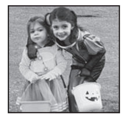
Halloween -Vinegar Hill, Saugus