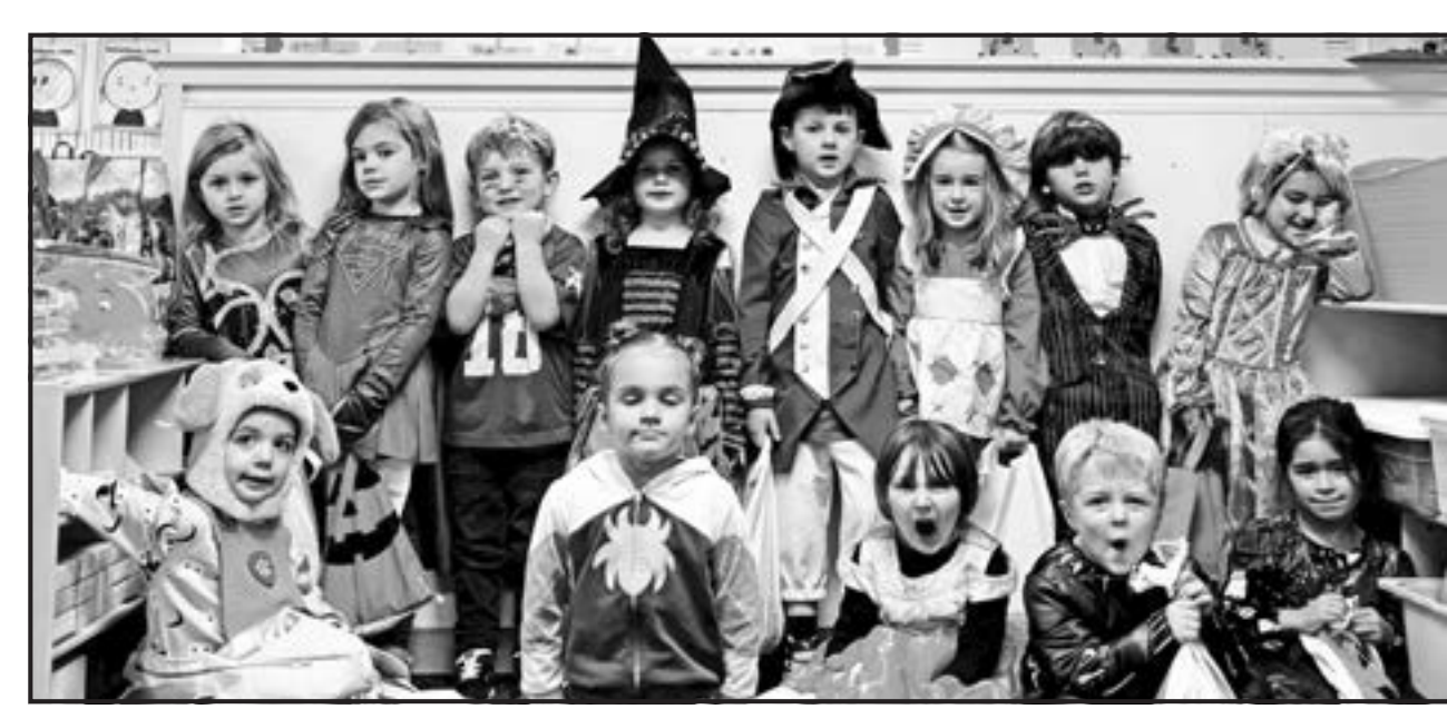
St. John School - North End Boston