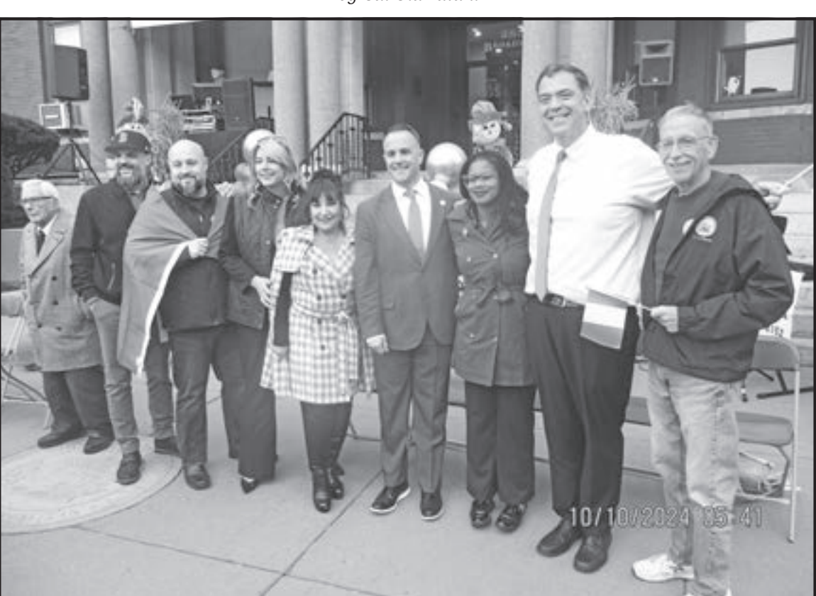
Local and state elected officials gathered on steps of City Hall

The City of Revere on Thursday, October 10th celebrated Italian American Heritage Month on the steps of Revere City Hall where elected dignitaries from both city hall and the statehouse gathered to honor all Italian Americans who call Revere their home. A large gathering of folks from across the city showed up for inspiring speeches, great