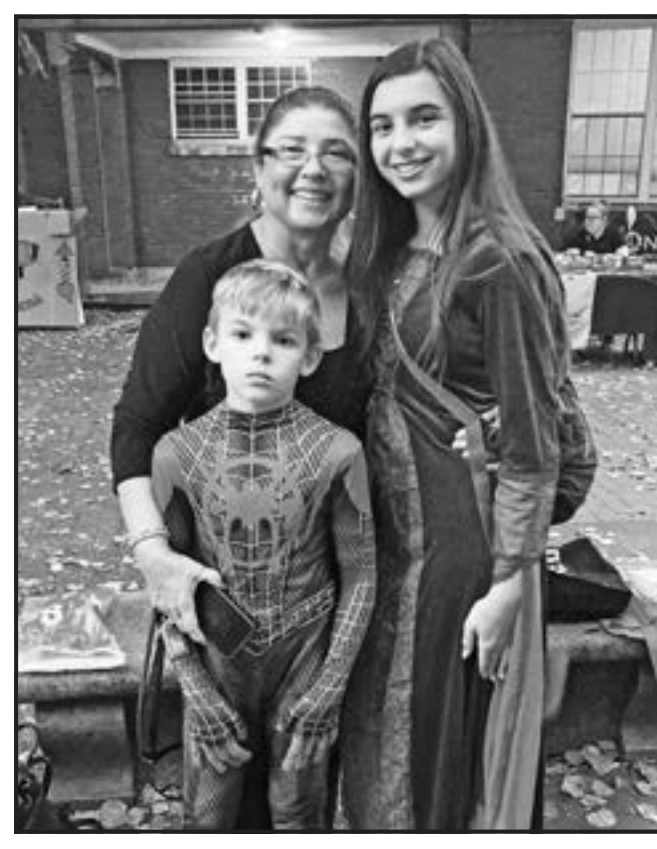
Halloween at the Prado, North End