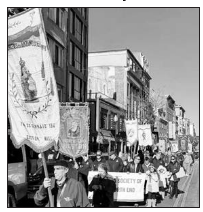
North End Feast Societies proudly display their banners in celebration of All Saints Day. (Additional Photos on Page 5)

Following this celebratory mass, a traditional procession took place through the streets of the North End. Led by the Children of St. John's School, the Italian American Band from Lawrence and the North End Marching Band, hundreds of participants marched along to the Ave Maria, the Italian National Anthem and many other favorites. The societies would like to thank all those who participated in this annual ritual and for the continuity of this joyful tradition.