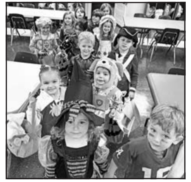
St. John School - North End Boston