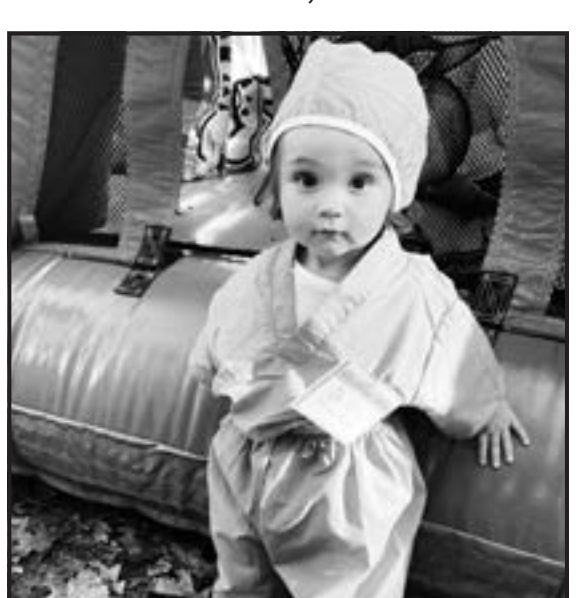
Halloween at the Nazzaro Center