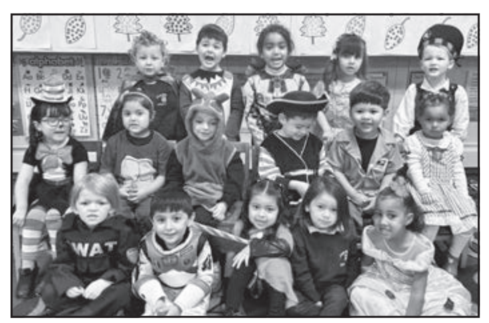
Halloweeen - East Boston Central Catholic School