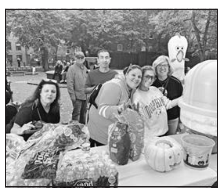
Halloween at the Prado, North End