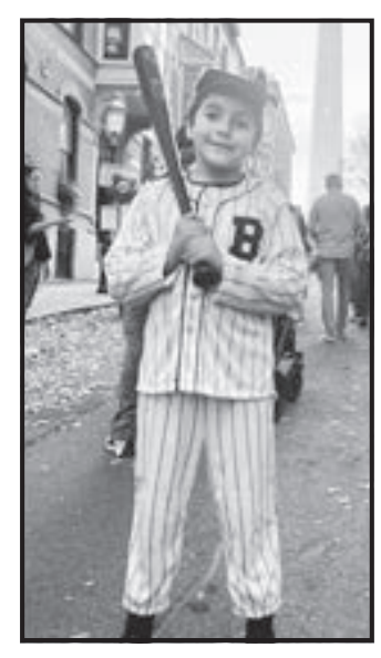
Halloween Charlestown Christian