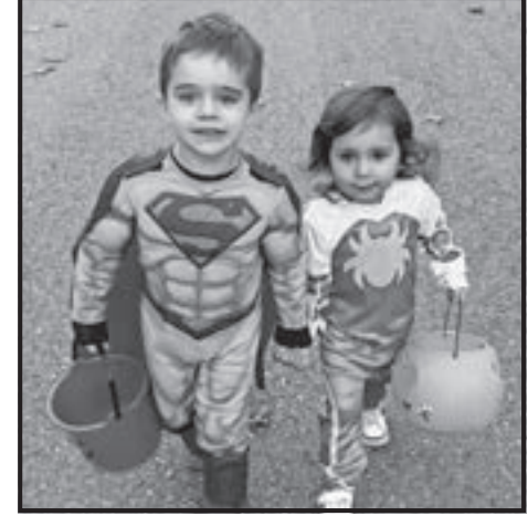
Halloween - Middleton