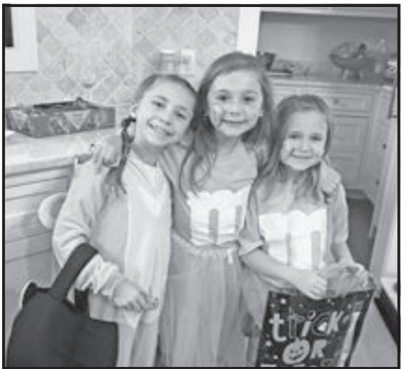
Halloween - Middleton