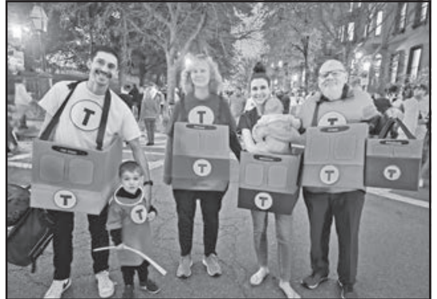
Trick or Treaters waiting for the "T"