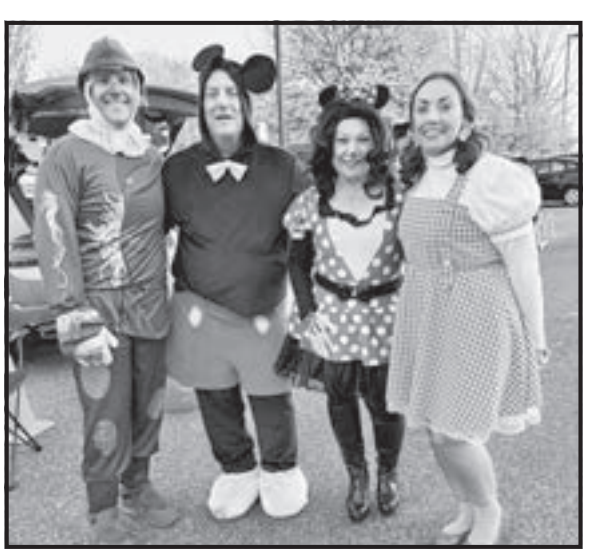
Halloween - Revere