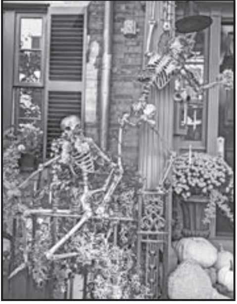
Halloween at Beacon Hill