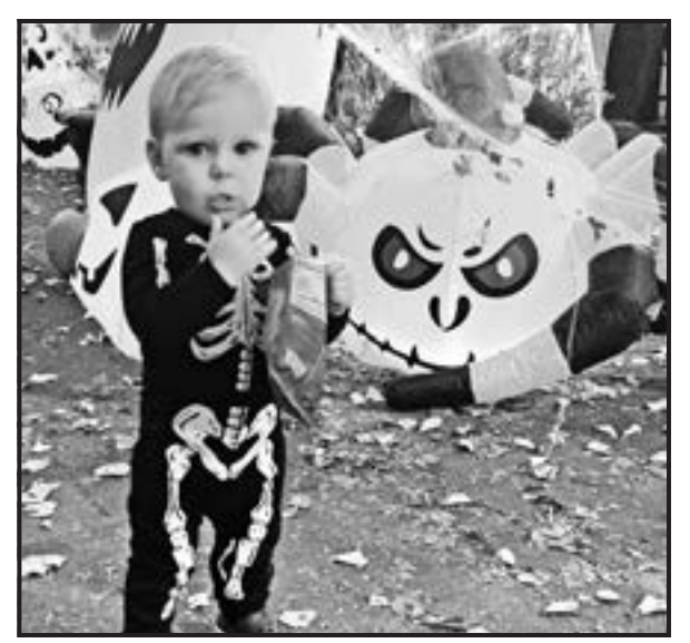
Halloween at the Prado, North End