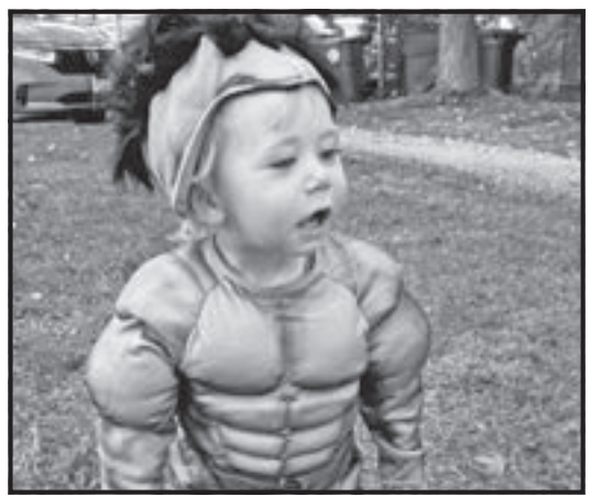
Halloween - Middleton

Spinelli's Will Cook Your Thanksgiving Dinner! ORDER A ..... Fully Cooked Whole Turkey