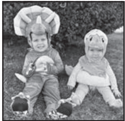
Halloween - Wakefield