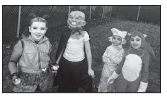
Halloween - Vinegar Hill, Saugus