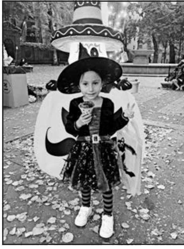
Halloween at the Prado, North End