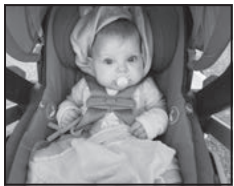
Halloween - Vinegar Hill, Saugus