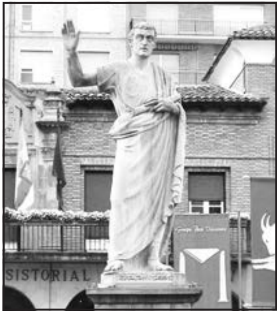
Quintilian's statue in Calahorra, La Rioja, Spain

Marcus Fabius Quintilianus, known to us as Quintilian, was a celebrated Roman literary critic, teacher, and rhetorician. He was born in Spain about 35 A.D. and received his training as an orator at Rome, but started his public career as an "advocatio" (legal counsel). Although he was well known for his legal work, he became quite famous as a teacher in rhetoric. Quintilian soon