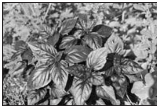
Purple basil varieties add color and interest to containers and gardens

Fresh on your pizza, added to your favorite Italian and Southeastern Asian dishes, or made into pesto, it's not surprising basil is often called the king of herbs.