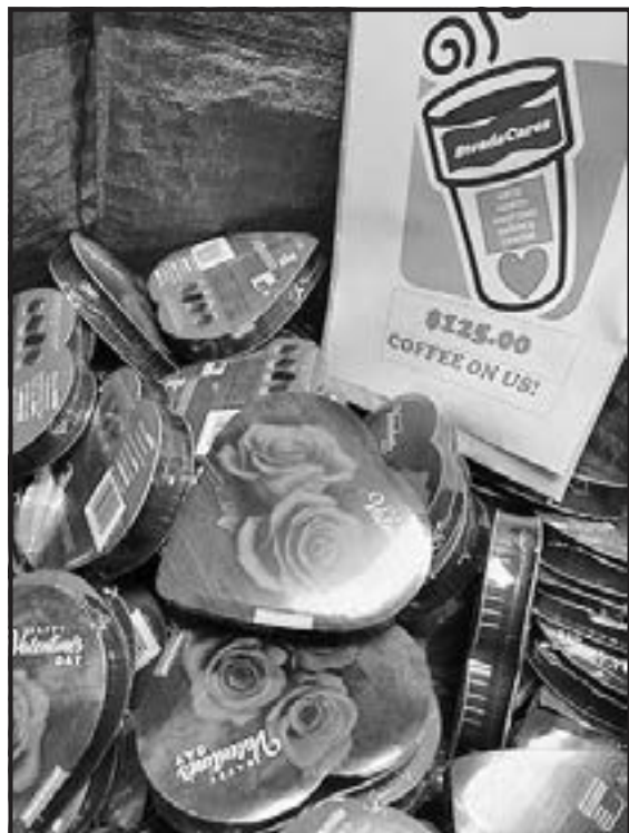
Thank you, Strada 234 residents, for the chocolates and gift cards!

A heartfelt thank you to everyone who made this celebration so special. From the delicious food to the thoughtful gifts, it was truly a day of love, laughter, and community spirit. Happy Valentine's Day from all of us at the NE/WE NSC!