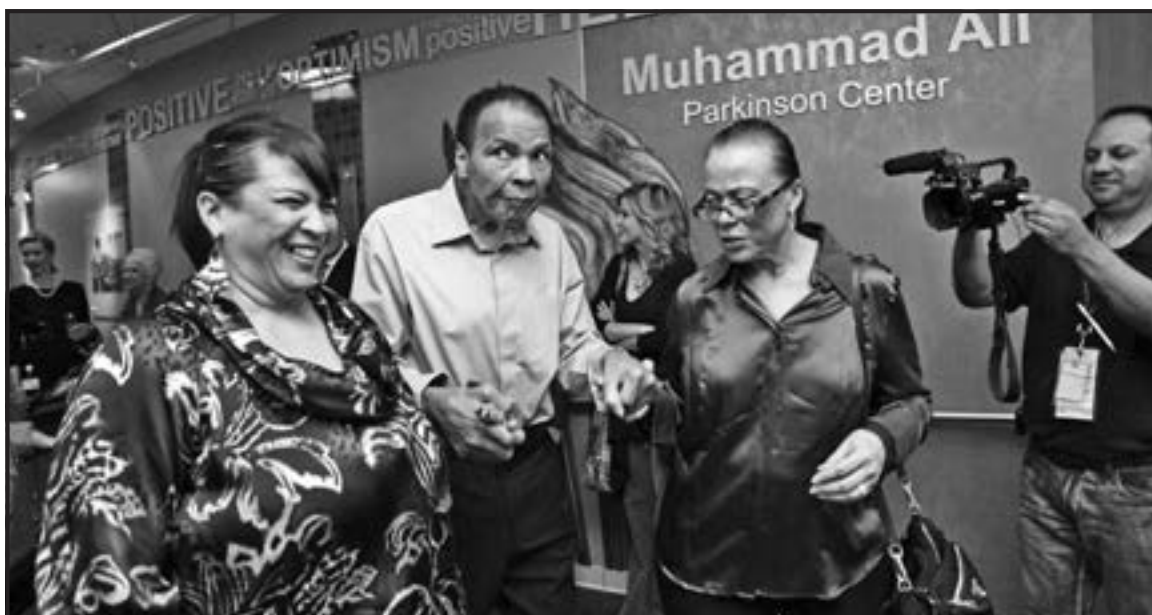
Muhammad Ali (center)