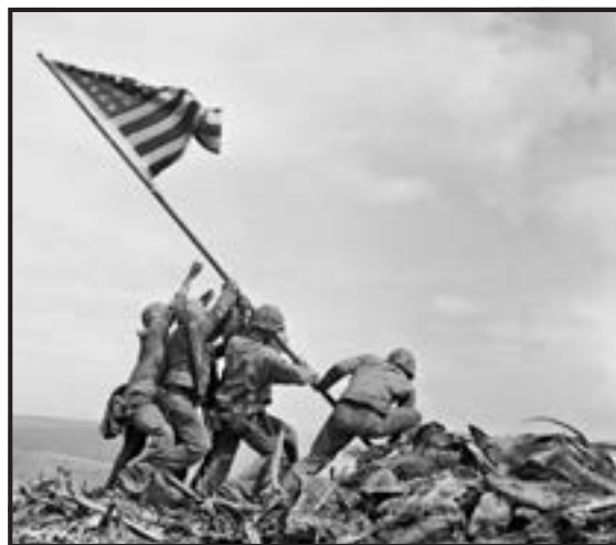
Marines and a Navy corpsman raise the U.S. flag over Mt. Suribachi on Iwo Jima. More than 80,000 Marines fought for 36 unrelenting days during this pivotal battle of WWII

It is hard to fathom that Iwo Jima happened 80 years ago. When I was a kid growing up in the ‘50s and ‘60s, Iwo Jima and everything about that bloody battle was still known and honored by all. My parents’ generation remembered well everything about WWII and all the sacrifices endured by members of the Greatest Generation.