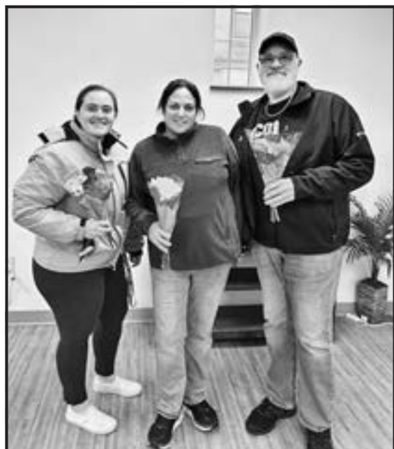
Beautiful flowers donated by North Street Grille