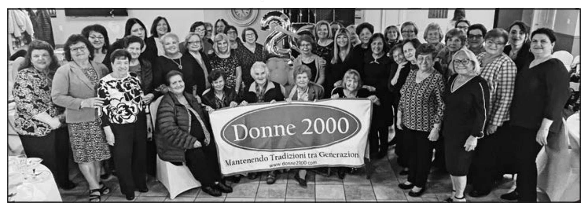
Donne 2000 Members