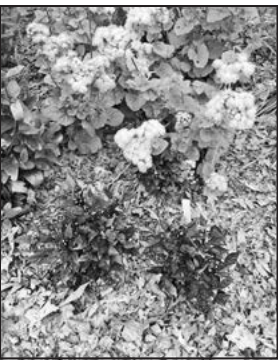
Leaf mulch conserves moisture, reduces the risk of erosion and compaction, suppresses weeds, and improves the soil as it decomposes.

Too much or not enough water and never when your garden needs it. This is a common complaint of gardeners no matter where they live. Make a few changes in your plant selection and garden care to help manage water use while growing healthy plants.