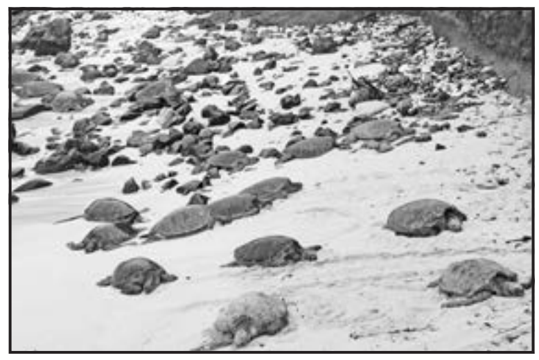
Green Sea turtle

It may not have been the most majestic sight I saw in Hawaii or the most picturesque, but the perseverance and unflinching courage of the green sea turtles flapping their flippers on the shore of Ho'okipa Beach to lay their eggs is surely among the greatest testaments to the resiliency of life in Maui. The turtles don't even make it look easy. They lay on the sand protecting their soon to be hatchlings, patiently awaiting the day the new generation of green sea turtles will accompany them back into the ocean. Before that day comes the parents put on a truly inspiring show of making their way back. Revolving their flippers they wade the rocky sand, slowly inching their way