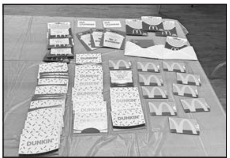
The Amazing Spread of Donated Gift Cards