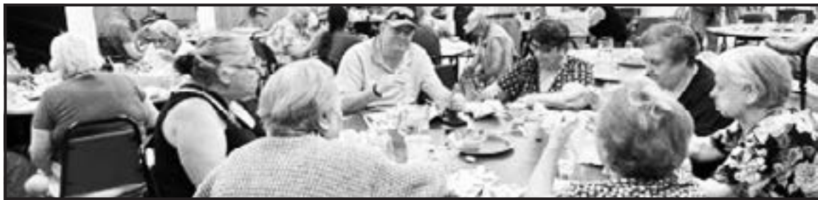
Enjoying the celebration