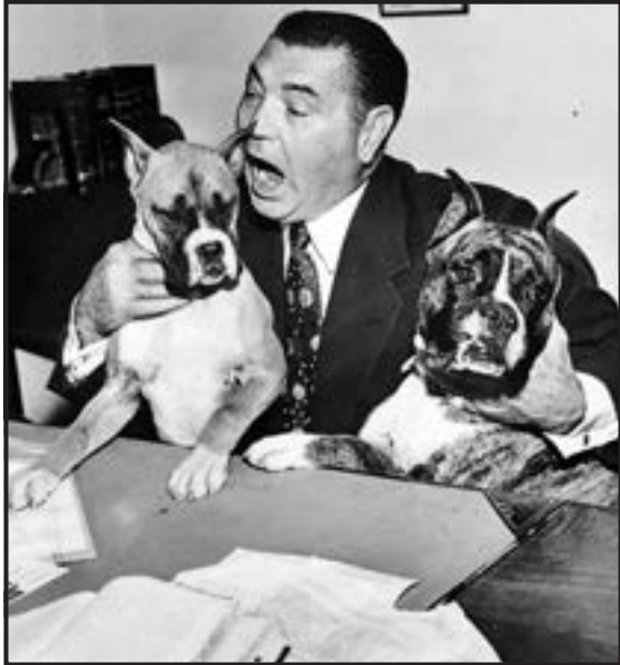
Jack Dempsey was known to be free with advice to up and coming boxers