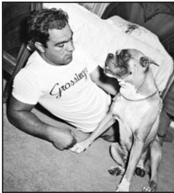
Rocky Marciano and another boxer comparing noses