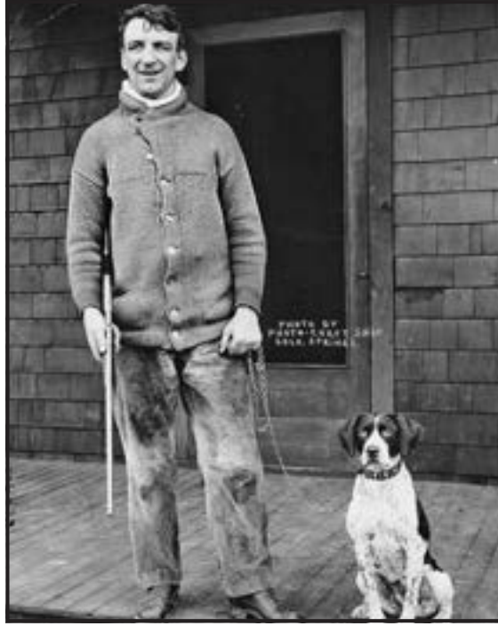
Freddie Welsh and hunting companion