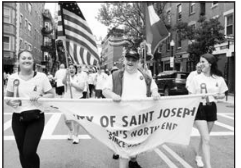
Members leading the procession with the society banner