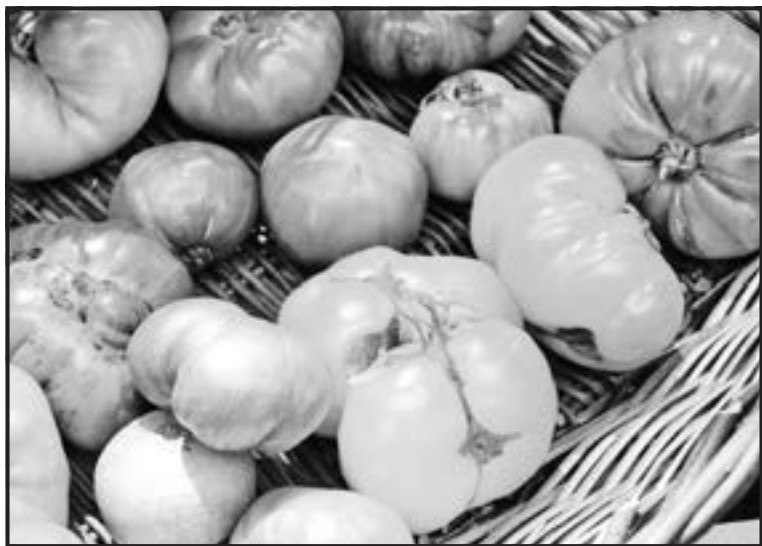
Cooler temperatures below 55°F can result in misshapen fruit and cat-facing as seen in this photo.