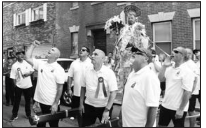
Society members encouraging the confetti and ribbon to drop