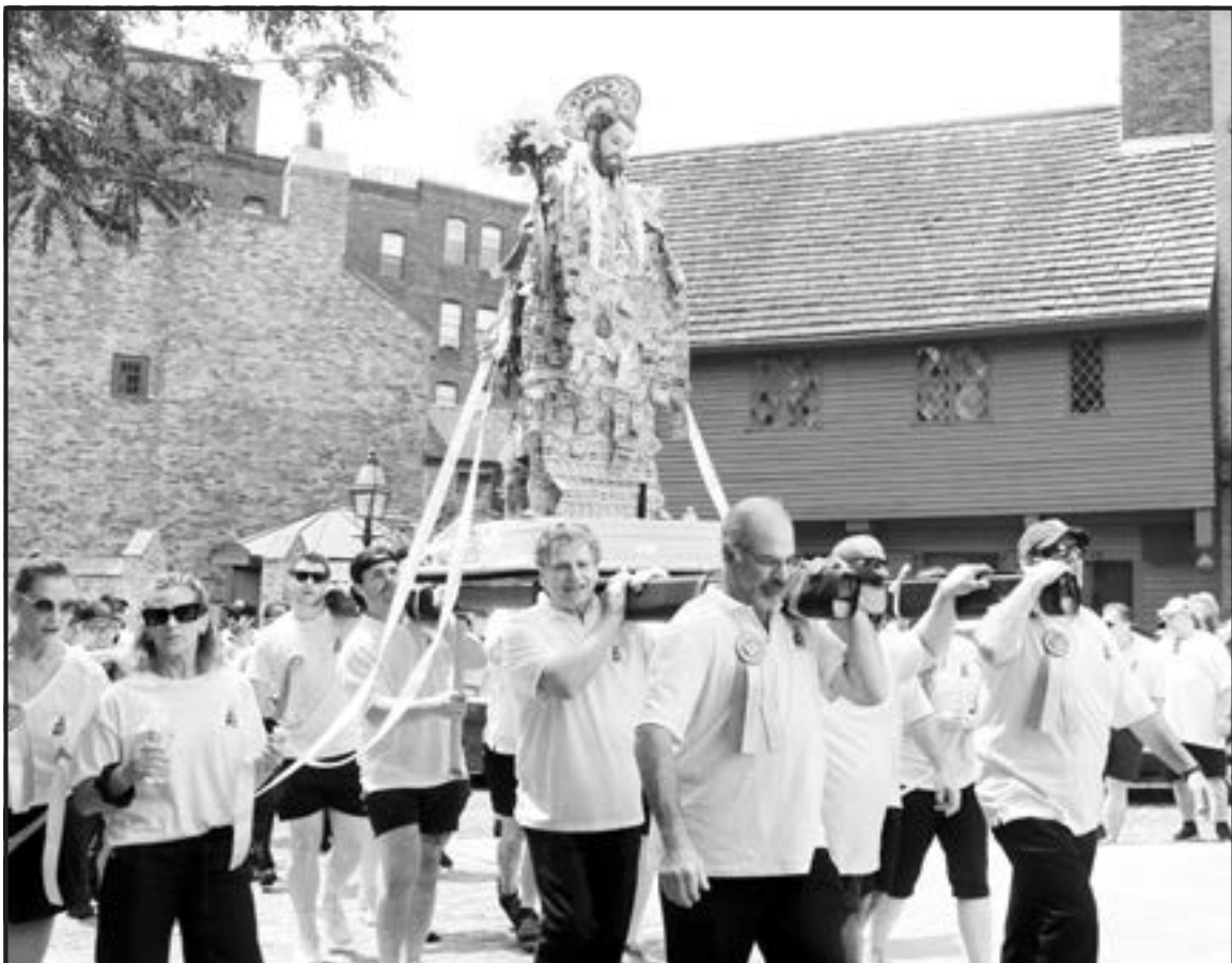
Devoted society members carrying St. Joseph through the North end neighborhood