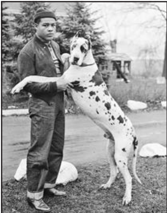
Joe Louis must have thought this fur legged friend was as tall as Buddy Baer and Primo Carnera