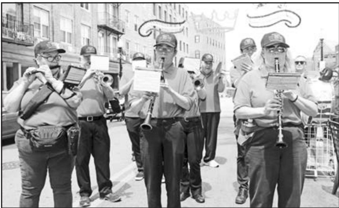
North End Marching Band