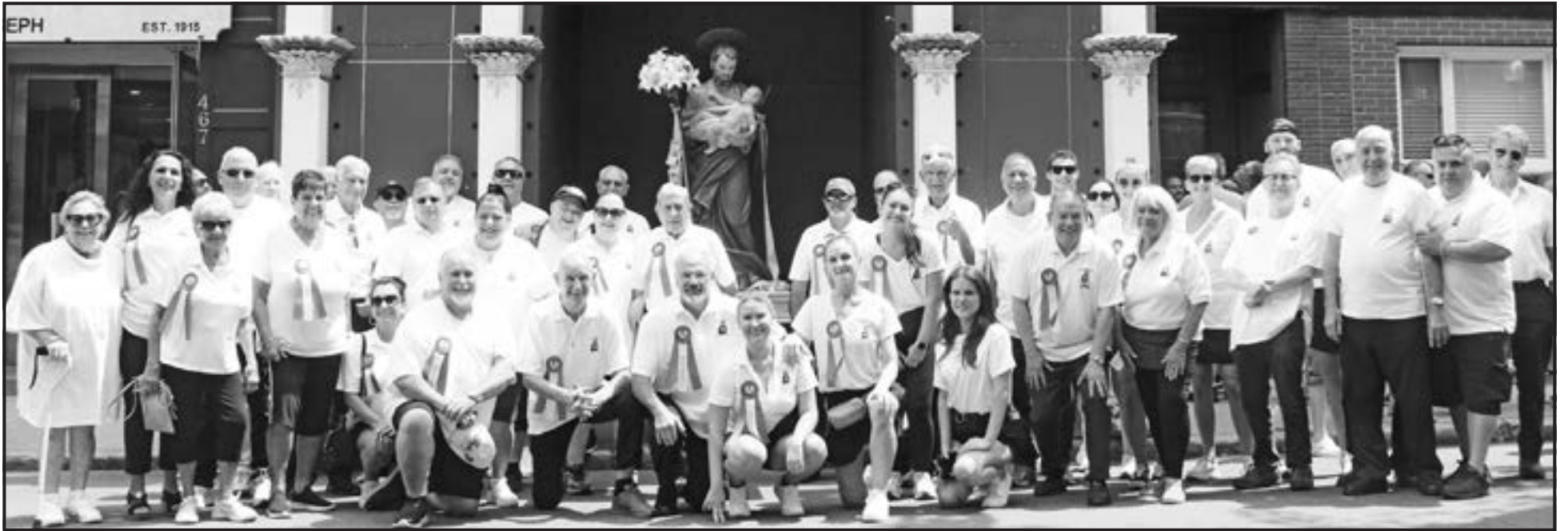
Society Members in front of the St. Joseph Club on Hanover Street preparing to begin the annual procession