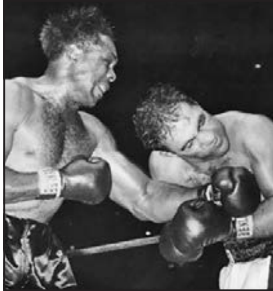
In the final fight of his career on September 21, 1955 at Yankee Stadium, Rocky Marciano KO's Archie Moore in the 9th Round