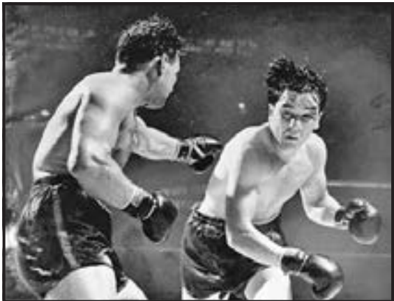
September 18, 1946 — At Yankee Stadium, in the 23rd defense of his title, Joe Louis KO's Tami Mauriello the 1st Round