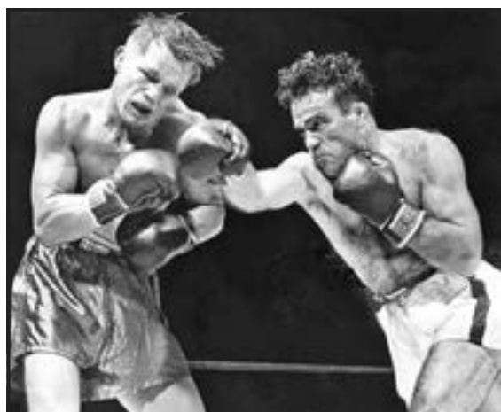
September 21, 1948 — Marcel Cerdan wins the Middleweight Title stopping Tony Zale in the 11th Round in Jersey City