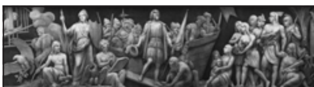
America in History Designs created & implemented by Constantino Brumidi (1805-1880), the Michelangelo of the United States Capitol