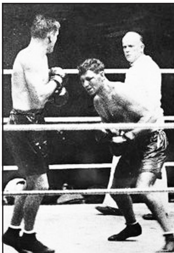
On September 23, 1926 — Before a crowd of 120,000, Gene Tunney wins the Heavyweight Title from Jack Dempsey in Philadelphia