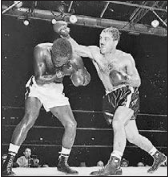
In a rematch of their 15 Round Decision Fight that took place the previous June, a badly cut Rocky Marciano knocks out Ezzard Charles in the 8th Round. the fight took place at Yankee Stadium on September 17, 1954