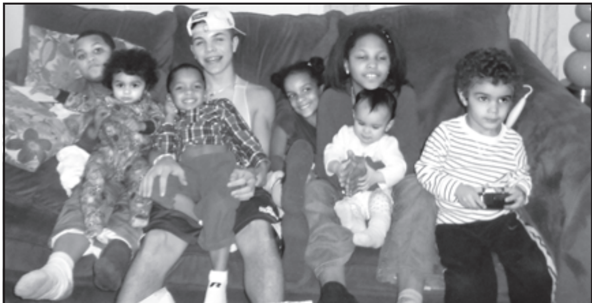
The next generation Giarratani family.