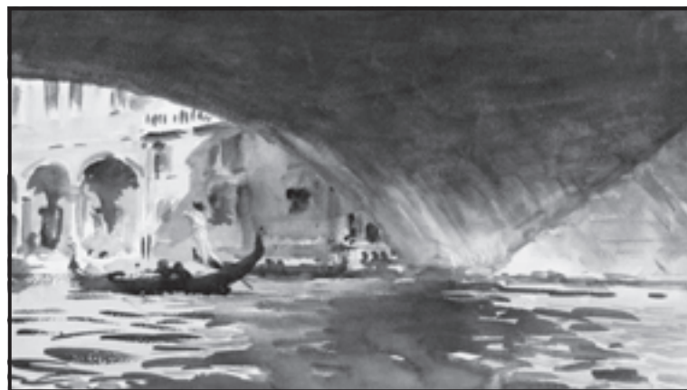
Breathtaking "Watercolors" by John Singer Sargent on display through January 20 th at the Isabella Stewart Gardner Museum.

figure skating, skiing, snowboarding and curling.