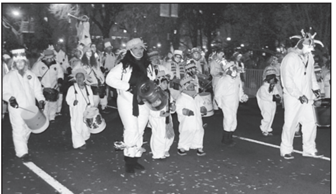
Many brave Bostonians took to the chilling streets of Boston on New Year's Eve in celebration of First Night. A highlight of the evening is the annual Grand Procession which kicks off on Boylston Street. This year's Procession included an array of participants from Back Alley Puppet Theatre, inflatables, mobile sculptures, drummers, dancers, clowns and of course the Duck Boats.