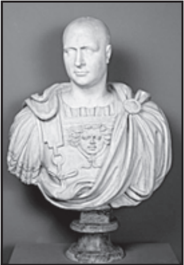
P. Cornelius Scipio Aemilianus Minor or Scipio the Younger

We continue with our brief biography of the literary Latins and the “Early Age” or “Age of Greek Influence.” Last week we discussed Andronicus Livius, the founder of Roman dramatic and epic poetry. This week the concentration is on the famous Scipionic Circle. First, of course, there was Scipio himself. When researching this great Roman it soon becomes evident that he is number 15 in a line of about 32 Scipios. Our famous Scipio of the moment is properly called P. Cornelius Scipio Aemilianus Minor or Scipio the Younger. He became a student of literature rather than a literarian. He was a great army general and served with distinction in Spain, destroyed Carthage, then reduced Africa to the form of a Roman province, in addition to a distinguished career as a Roman Consul. This Scipio was also a brilliant orator and patron of the arts who gathered around him a group of statesmen, philosophers, poets, historians and playwrights. The group soon became known as the Scipionic Circle and included men like Polybius, Panaetius, Terence and Lucilius.