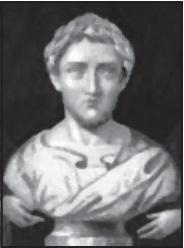
Publius “Terence” Ternetius Terence, whose full name is Publius Ternetius Afer,

came to Rome as a slave from Libya. His owner, Ternetius Lucanus, was impressed by his natural literary gifts, had him educated and later gave him his freedom.