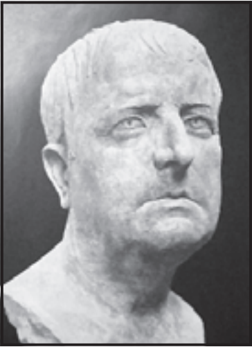
Gaius Lucilius Our last Circle member is Gaius Lucilius who was the creator of Roman satire. He was born of a good family, served under Scipio in the Spanish campaign and became his friend. He developed the satirical form in which it is later found in Horace and Juvenal. He wrote 30 books of satires but only about 300 lines are preserved in fragmentary form, thus leaving just a slight clue to his method and style. It appears that he was boldly original and almost an eccentric genius. He had a most unusual vocabulary that overflowed with strange words and disgusting expressions and never did learn how to say “arriverderci.”

After writing six successful comedies, Terence visited Greece in order to study Greek life and institutions, so that he could represent them accurately on the Roman stage. He died in a shipwreck at sea on his return trip from Greece and we are told that 108 translations of Greek comedies perished with him. In his comedies, Terence took his adopted Latin language and made it more artistic by carefully shaping it to the graceful rhythm and diction of the Greek dramatists. His work has been studied and praised by succeeding masters who agree that dramatic literature in general is indebted to Terence, who has left a marked influence on the style of later years.