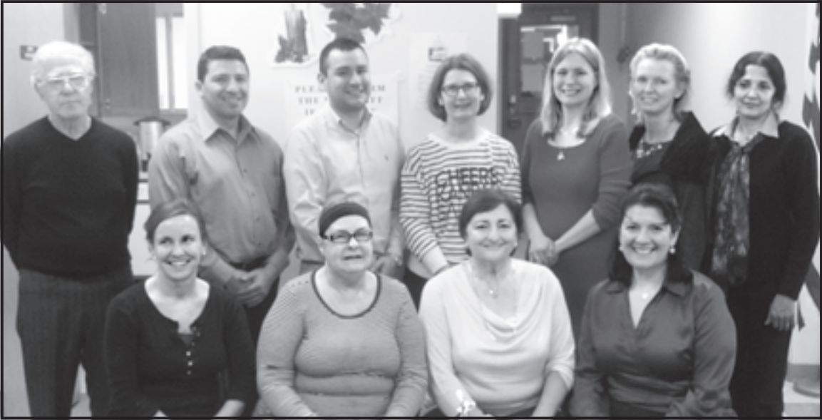
Staff, volunteers and board members from the ABCD North End/West End Neighborhood Service Center, along with some visitors from United Health Care.

The ABCD North End/West End Neighborhood Service Center recently held its end of year holiday celebration. Over 75 members of the community, nearly all of them seniors from the neighborhoods, came to the center at 1 Michelangelo Street in the North End to enjoy salad, antipasto, chicken cutlets, lasagna, Italian cookies, cake and cupcakes. The NE/WE NSC's fantastic team of volunteers cooked the meal, as they do every week, and handled everything from menu planning, shopping, cooking, serving, and clean-up! They do it with such love and dedication and the North End/West End Neighborhood Service Center cannot thank them enough for their ongoing support.