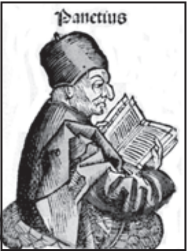
Panaetius of Rhodes Panaetius of Rhodes was one of the greatest stoic philosophers of his time. Stoic philosophy, as we know, is that which teaches of a divine power and its control over all happenings and destiny. It also teaches to calmly accept these happenings. Panaetius was educated at Athens and became the head of their stoic school and died at the age of 69 or 70 years of age. Only unimportant fragments of his writings remain, however, it is said that some of his early work furnished inspiration for many of the orations of the great Cicero.

Later when Greece was converted into a Roman province, Polybius was placed in charge of organizing the new government in the Greek cities and it was here that he gained the highest recognition for himself. His later years were spent in travel and writing. He wrote at least 40 books which recorded the rise of Roman supremacy, its efforts toward world-wide domination, its consolidation and its defenses against overthrow. His record of occurrences is clear, sound, truthful and is ranked with the greatest of historical writings.