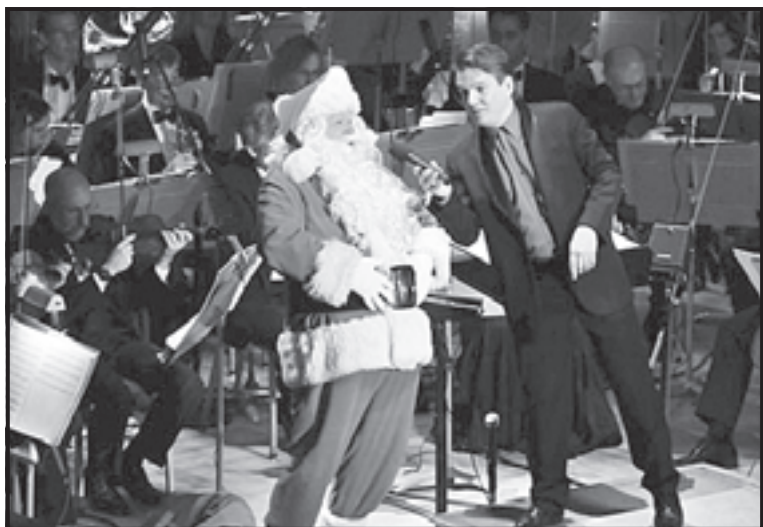
The Boston Pops always put on a classic holiday performance that they vamp up each year but the "special guest" appearance always stays the same.