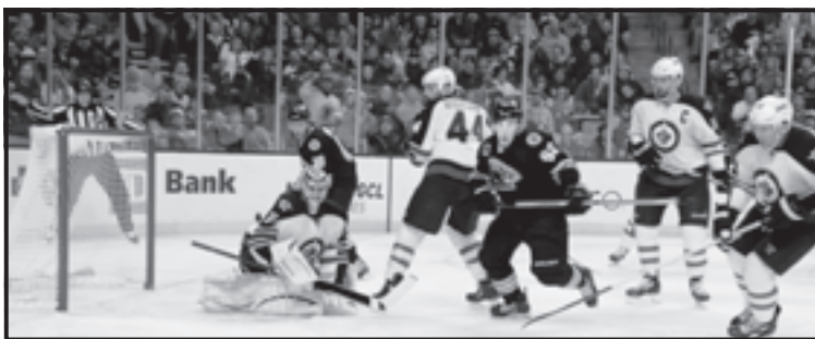
Bruins Left Wing Brad Marchand takes a shot on Winnipeg Jets Goalie Ondrej Pavelec. The Bruins defeated the Jets 4-1 on Saturday, January 4, 2014 at TD Garden.