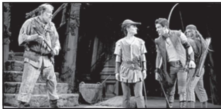
The Heart of Robin Hood has been making headlines for its smash performance and will be in Boston on the Loeb Drama Stage through January 19 th .