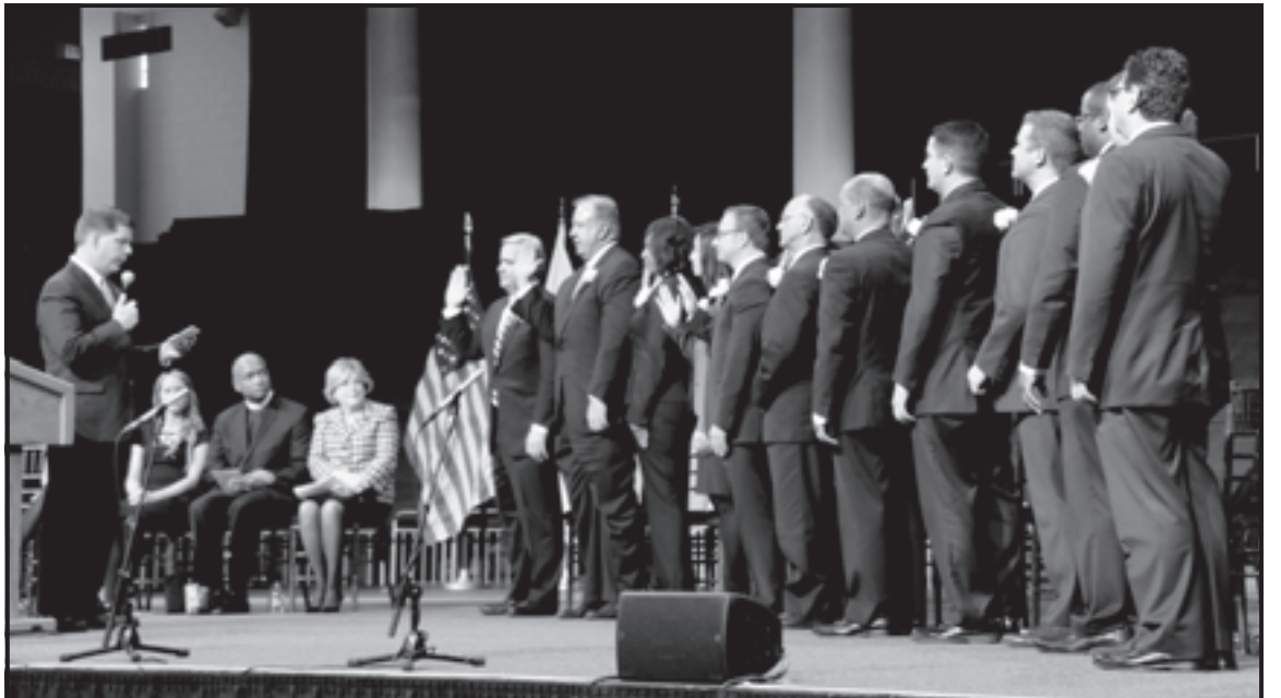
Members of the Boston City Council taking the Oath of Office.

Many are now saying that with Mayor Walsh, we will get another Ray Flynn, an Irish politician from the neighborhood. Then it was Southie, now it is Savin Hill Thirteen must be a lucky number. Savin Hill is Ward 13 and Southie has Wards 6 and 7.