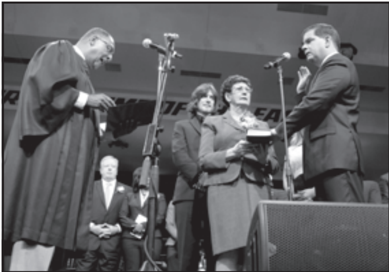
Martin Walsh being sworn in as the 54 th Mayor of the City of Boston on Monday, January 6 th at Boston College during an Inaugural ceremony.

In all transparency, I did my part in helping Marty Walsh get elected as Boston's new mayor in over 20 years. The last time I felt this excited about a mayor's race was back in 1983 when I was on the campaign trail with close friend Ray Flynn who I had known going back to those dark days of forced