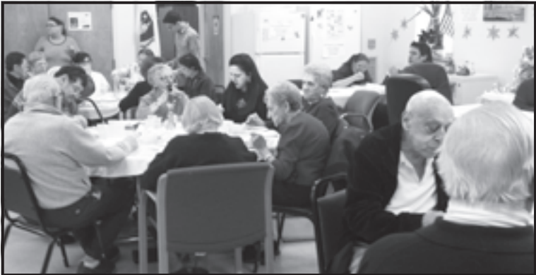
Some guests at the holiday celebration.