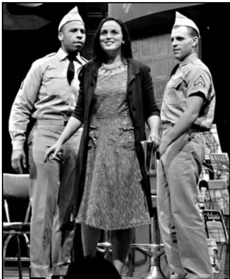
Flick, Violet and Monty

My review of the Speakeasy Stage Company's production of Violet could be summed up in just three words: See this play.