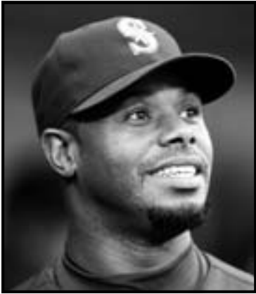
Ken Griffey, Jr.

Congrats to Ken Griffey Jr. and Mike Piazza for getting inducted into this year's class of Hall of Fame entries. Griffey was a shoo-in, while Piazza was a bit of a surprise with the steroid issue that many connect to his career. His entry means that the writers who voted are looking at those from the commonly referred to Steroids Era.