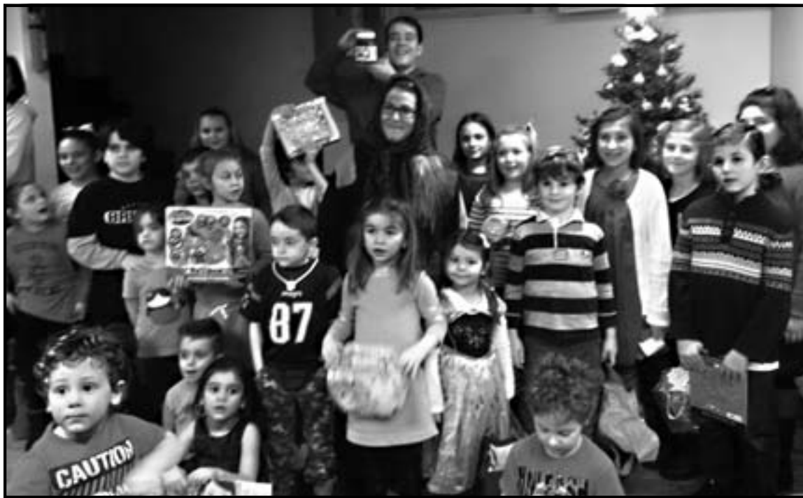
La Befana and children.

For more information on Donne 2000, please visit www.Donne2000.com