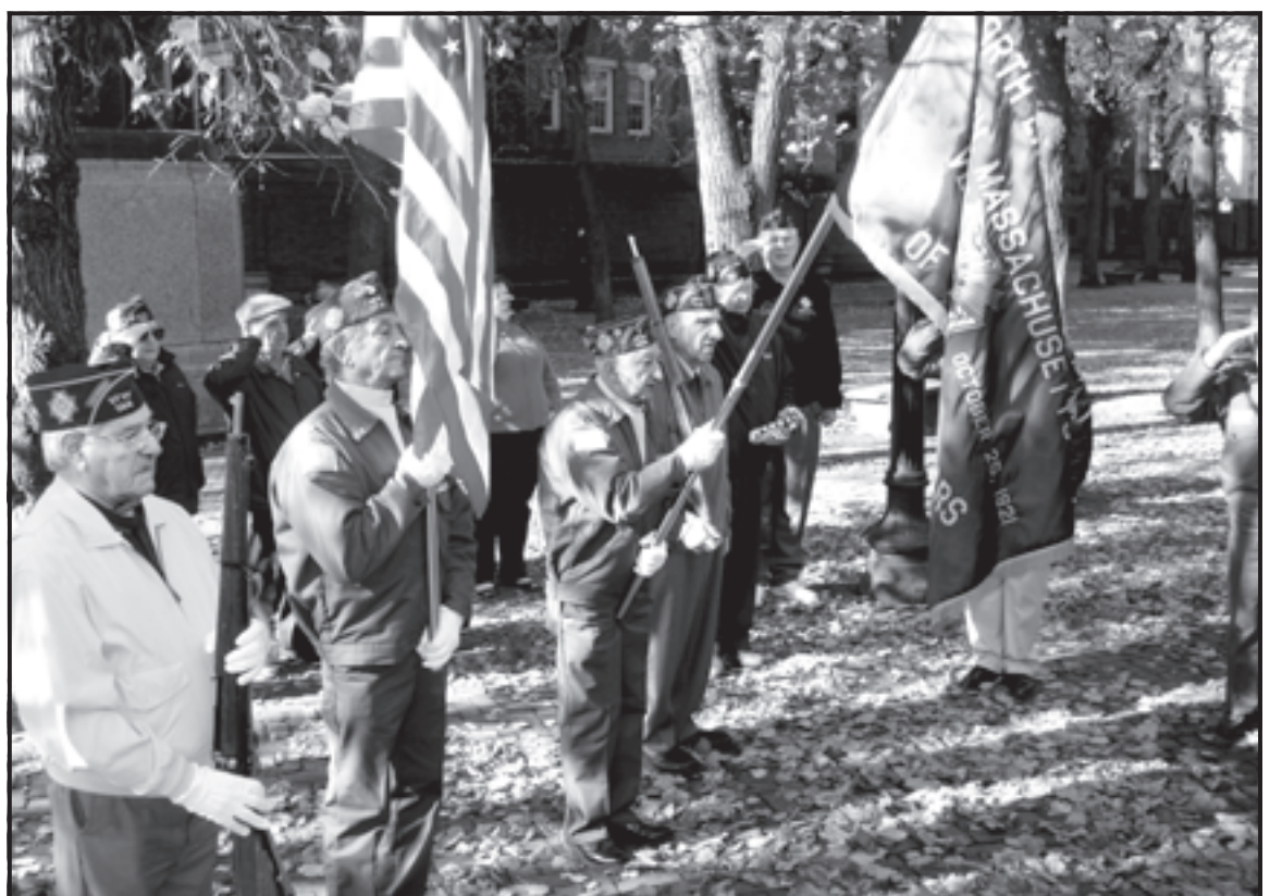
The Veterans of Foreign War Post #144 in the North End held their annual march on Hanover Street, Boston, on Veteran's Day in recognition of our veterans who have passed on and for those fighting for us today. Veteran's Day is a day to remember the brave heroes who have fought and continue to fight for the United States of America.

(Photo by Dom Campochiaro, D&amp;S Video)