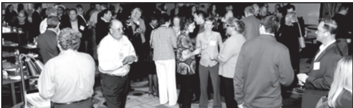
Members of area Chamber of Commerce's mingling at the Networking Night.